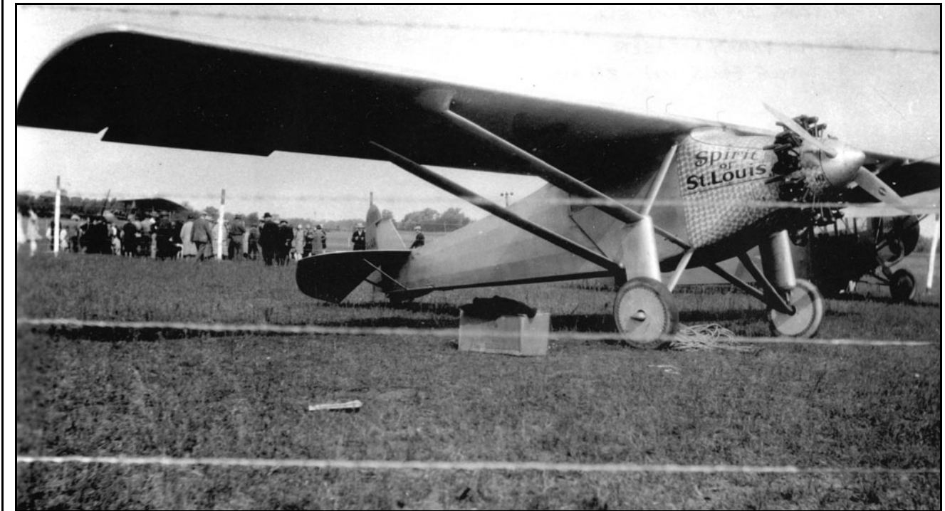
Spirit of St. Louis at Little Falls, Minnesota 1927