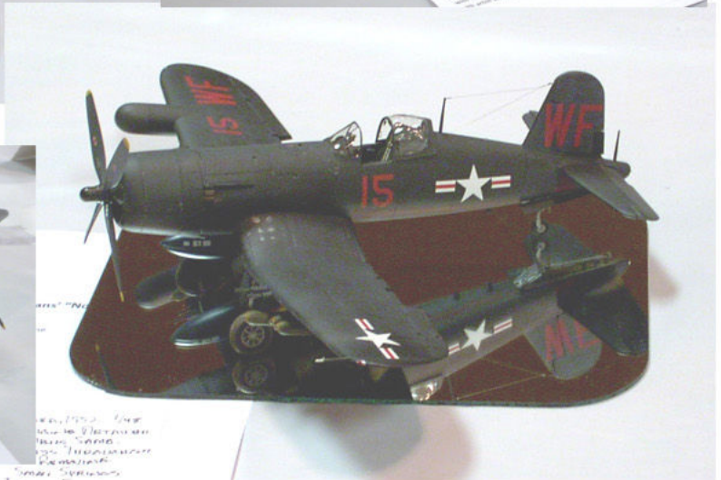
A Selection of Images from Nordicon 2008