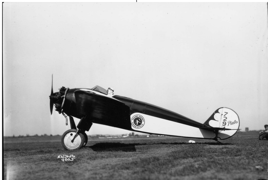
Mohawk MLV 7294 Pinto at Minnesota State Fairgrounds, 1928. MN State Fair photo #8025.

The Mohawk series achieved three federal ATC numbers and Mohawk aircraft were on the Minnesota Civil Aircraft register until 1934 with at least a pair becoming classroom training units during that time.