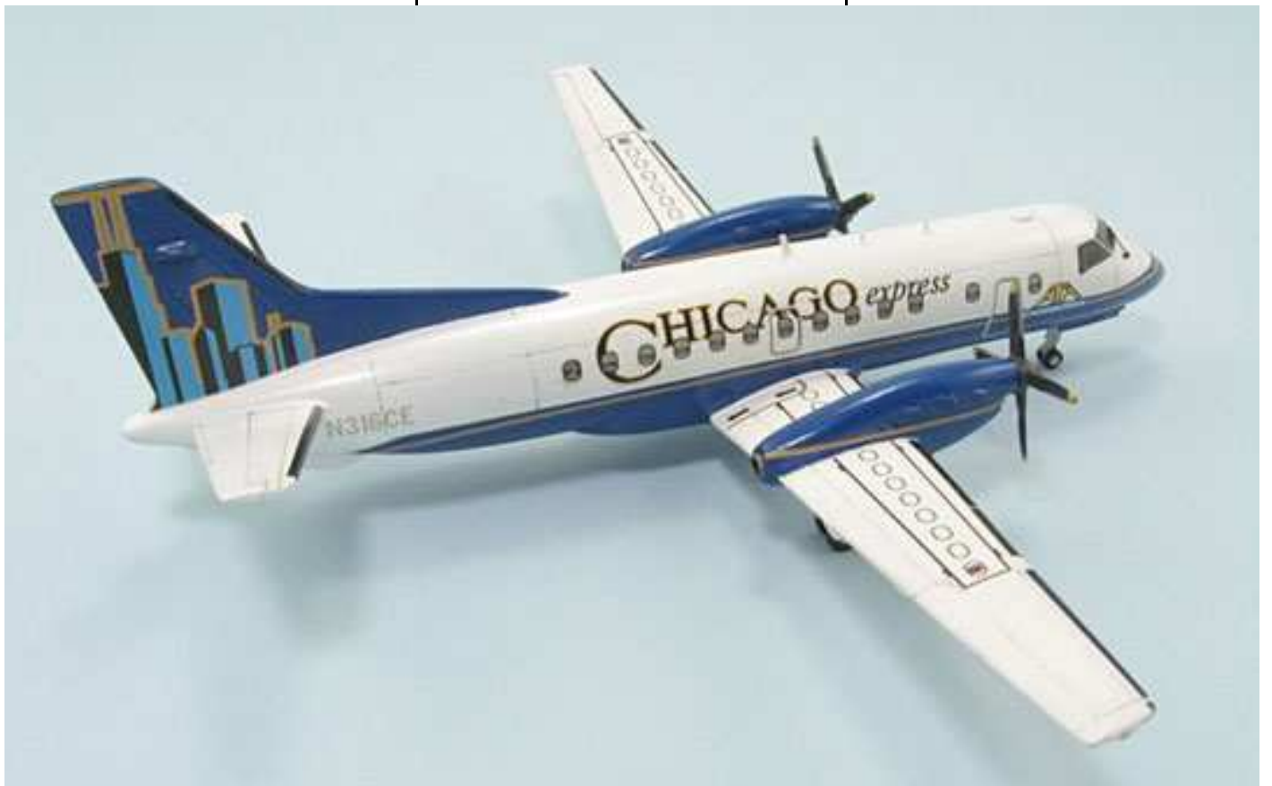
Welch Models 1/144th Saab 340 done up with DrawDecal's sheet by Frank Cuden