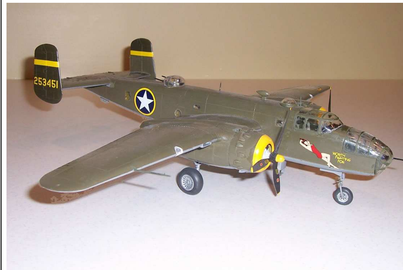
1/48 Accurate Miniatures B-25 C/D by Mark Rossmann

The B-25C was manufactured at the Inglewood North American and the B-25D was manufactured at the Kansas City North American plant, with deliveries of both models beginning in January of 1942. Block numbers for "C" and "D" were identical; -5, -10, -15, -20, -25. The "D" had two additional block numbers of -30 and -35. In all 1619 "C" and 2290 "D" models were produced.