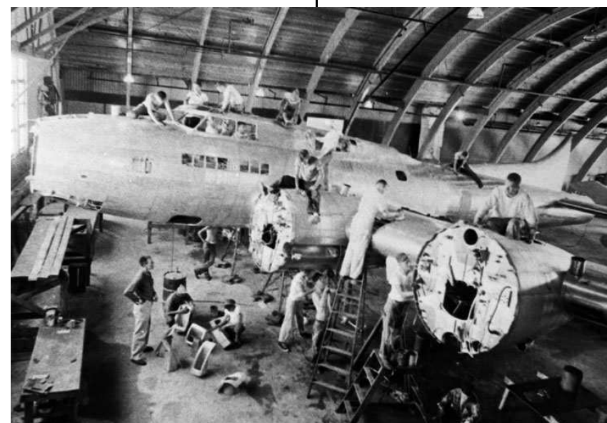
B-17 in Lysdale Flying Service hangar undergoing refurbishment

(Continued from page 1) the old engines, recovered the fabric control surfaces within four days and brought it to Fleming Field where they converted it to a photographic survey aircraft, overhauling the engines, and getting rid of all the military accoutrements. It was sold to the government of the Netherlands for aerial photography and was reported still in use in 1966.