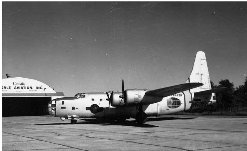
PB-4Y-2G at Lysdale Flying Service 1958