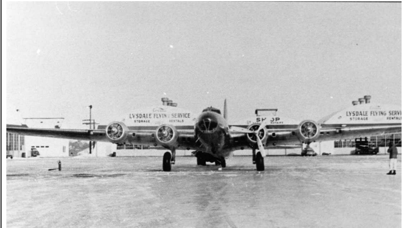
B-17E at Lysdale Flying Service, Fleming Field, 1955