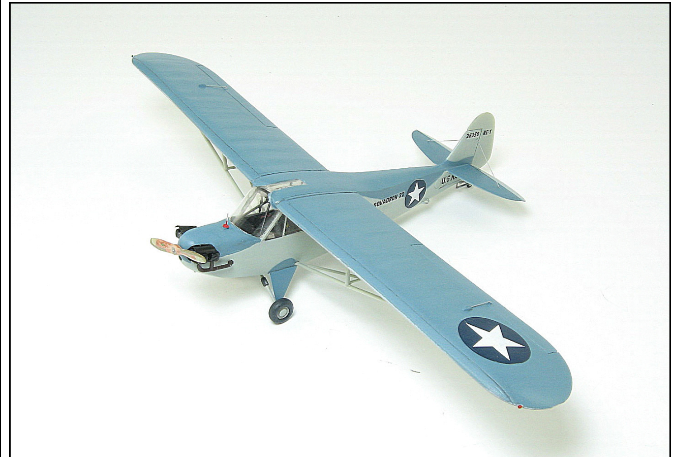
Hobby Craft 1/48 scale NE-1 (Piper Cub) by Frank Cuden