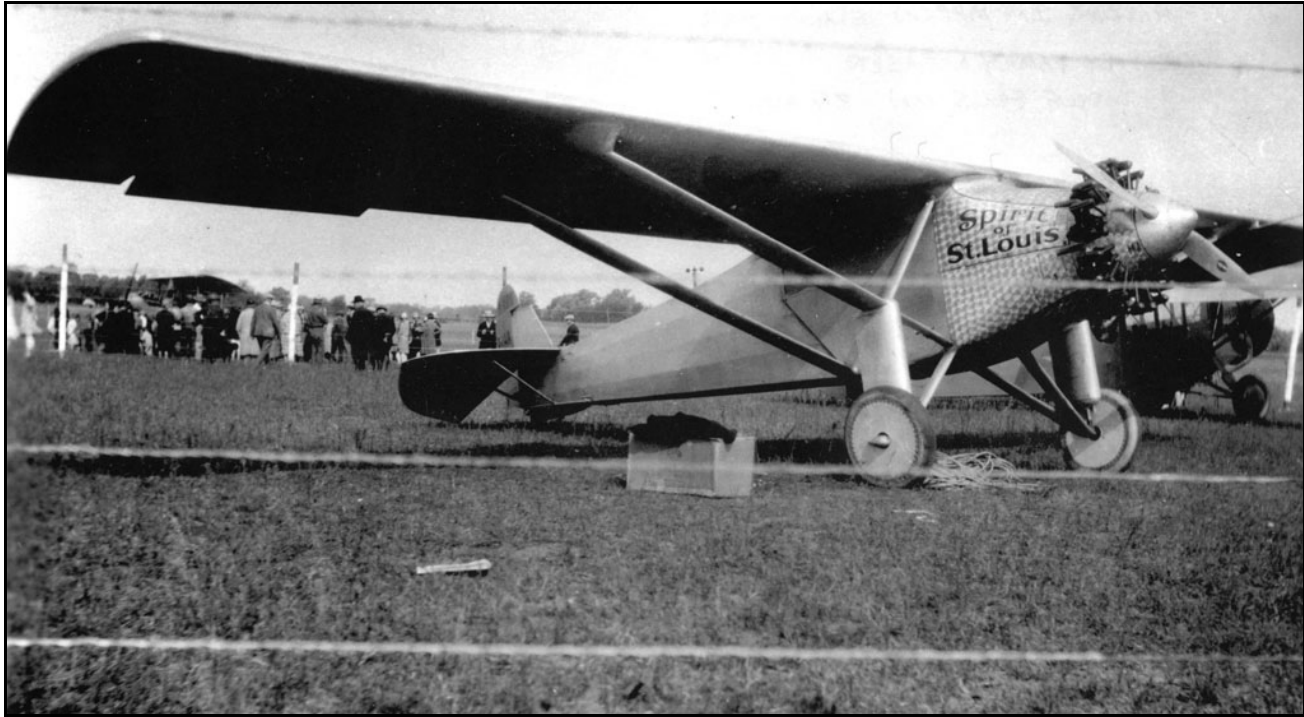
Spirit of St. Louis at Little Falls, Minnesota 1927