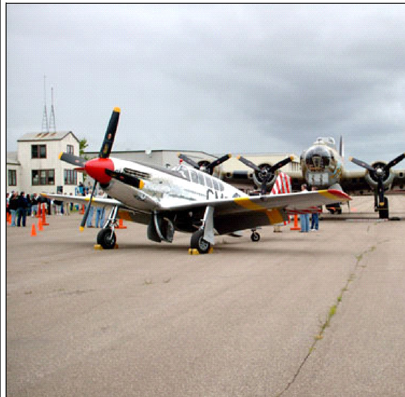
CAF MN Wing P-51C in 2009 In front of the Collings Foundation B-17 At the Anoka County Blaine Airport (Janes Field) 1/1 Scale