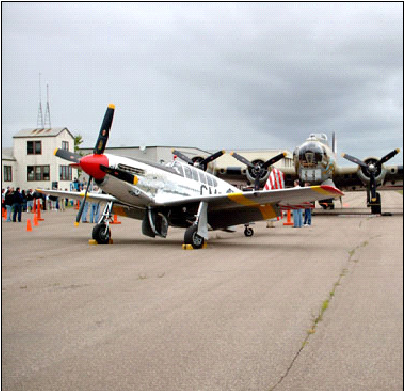
CAF MN Wing P-51C in 2009 In front of the Collings Foundation B-17 At the Anoka County Blaine Airport (Janes Field) 1/1 Scale