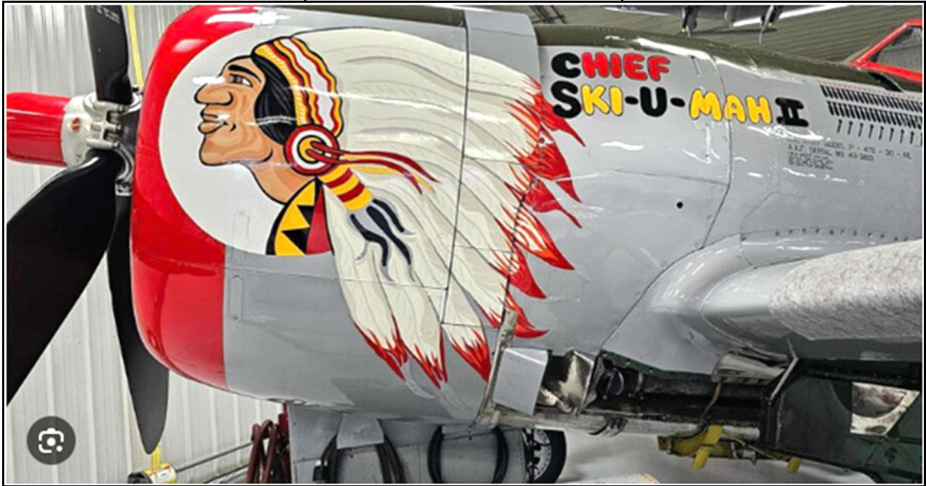
Republic P-47D-30 Thunderbolt – Fagen Fighter Museum – Granite Falls, Minnesota

Our next TCAH “field trip” will likely be this summer where we are looking at a one-day visit to the Richard I. Bong Veterans Museum in Superior, Wisconsin